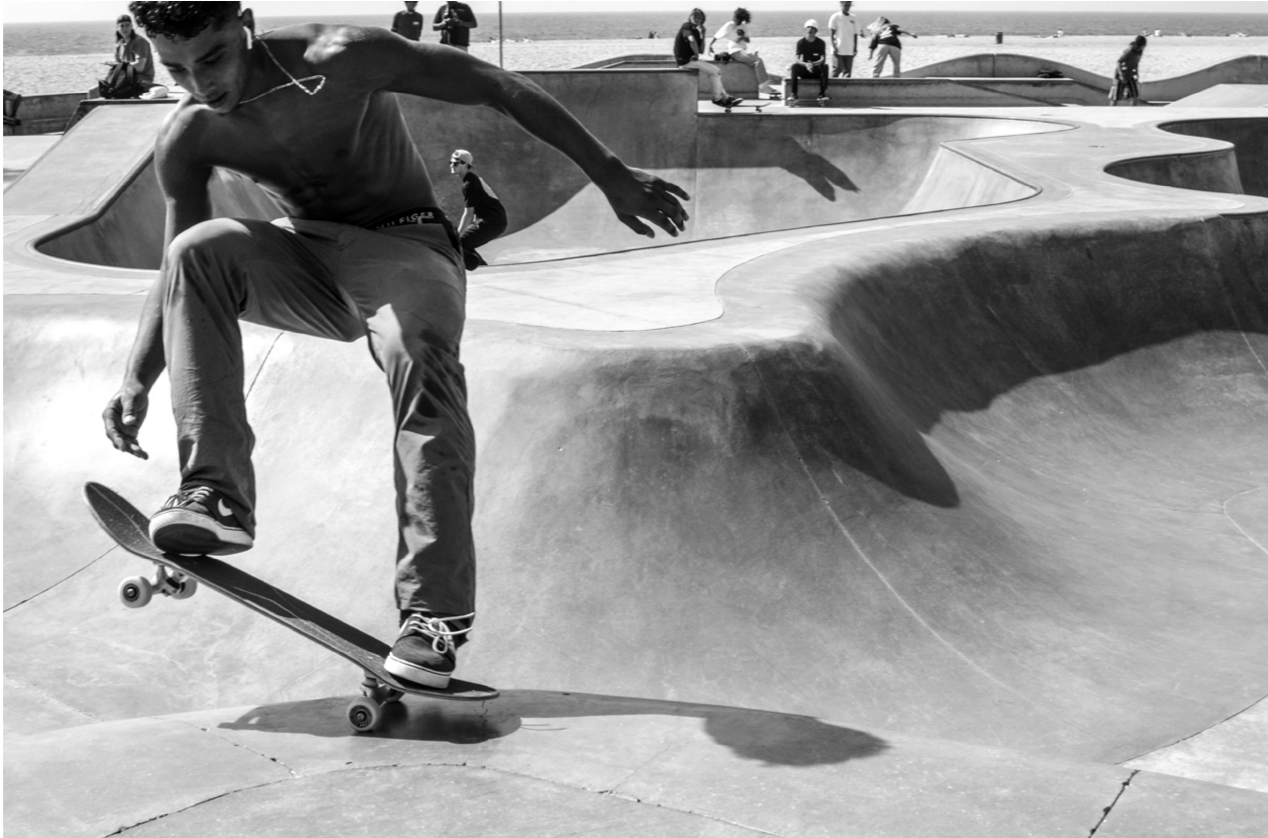
Inspiration for DJCITY Studio Photograph | LA, 2017