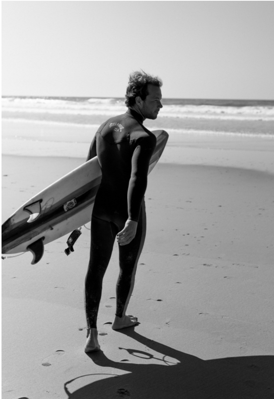
Editorial A day of surf with Billabong.